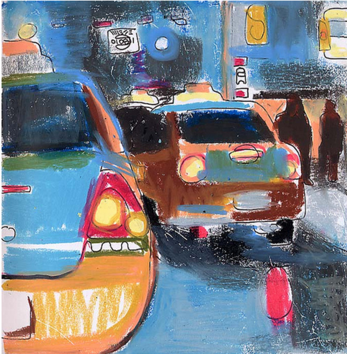
Jerry Waese, www.spacing.ca , January 13, 2011